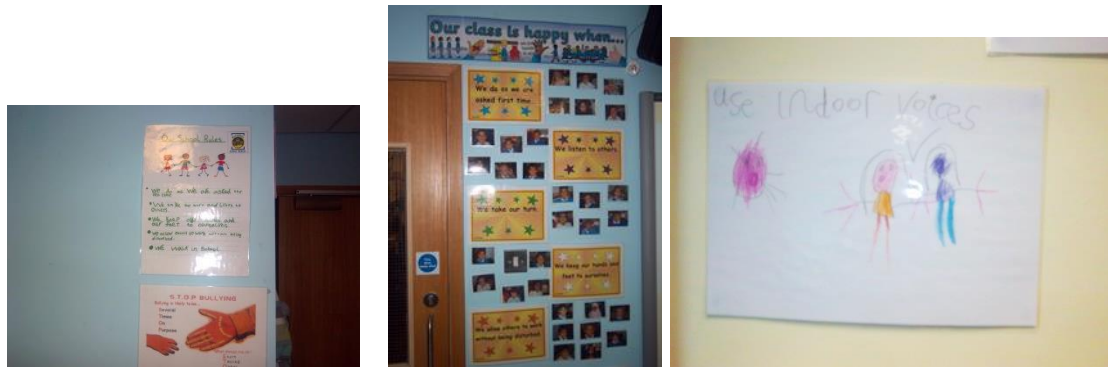
Our agreed school rules are in every classroom

curriculum where the police and local community workers are involved in our 'people who help us' topic.